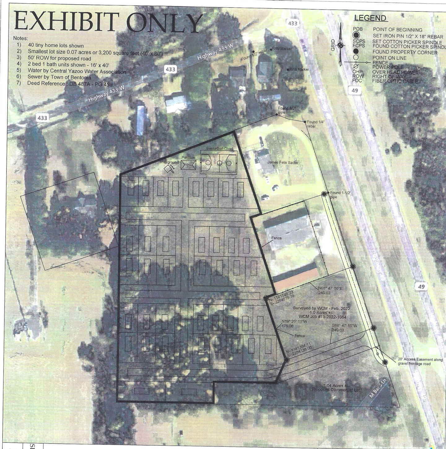
EXHIBIT PREPARED FOR : JOE SHIVIERS

SECTION 11 TOWNSHIP 9 NORTH RANGE 2 WEST